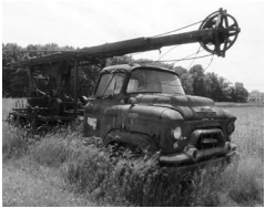
1950s GMC Hydromatic 450 Well Drilling Truck; 2003 Chrysler Town & Country Van.